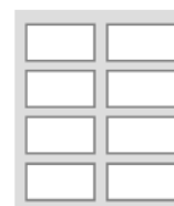
e) business card

Email ads to: rmconnell@acsalaska.net by 4/14/2015